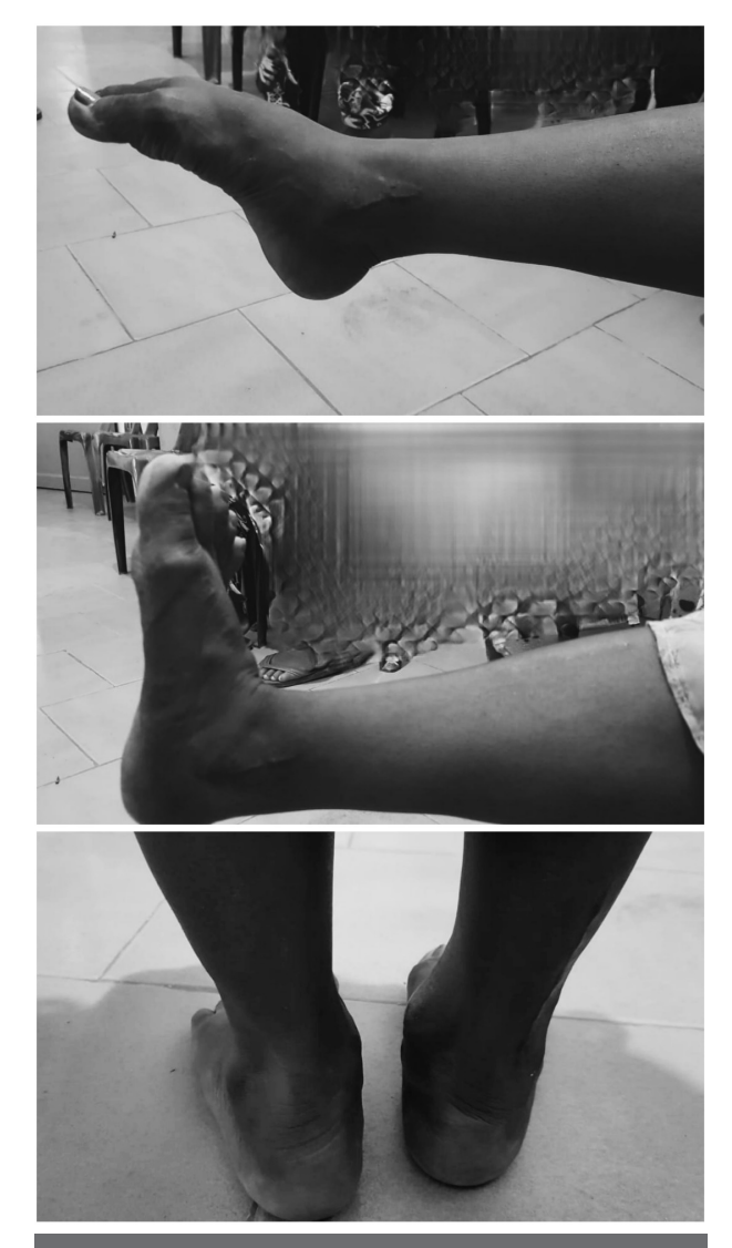
Figure 2: Clinical pictures at 2 years follow up of same lady.

0.042) but there was no difference between 1 year and 2 years period (p-value 0.084). An excellent score (91-100) was seen in 14 patients (53.84%) and good score (61-90) was seen in 10 patients (38.46%) and fair score (31-60) was seen in 2 patients (7.69%) at the end of follow-up. Overall good to excellent result was present in 92.3% of the patients (Figure 2).