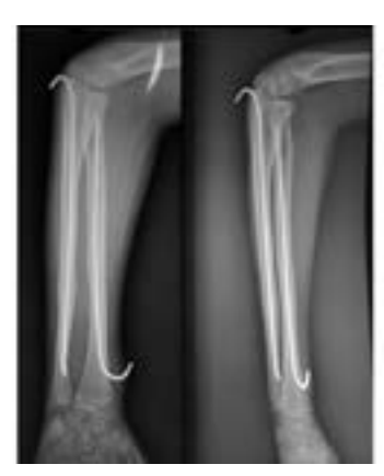
Fig. 4: Bony Union

All the results were clinically evaluated using price CT et al scoring criteria (Fig. 6-9). The 27 patients had an excellent result followed by