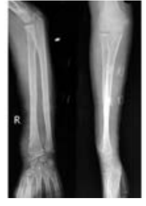
Fig.5: Implant (TENS) Removal

good in 6 patients and fair in 2 cases. There were no patients with a poor outcome. (Table 2)