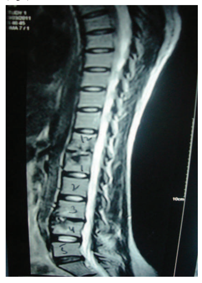
Figure 2. Skip lesions of TB spondylitis Proper initiation of ATT in the early phases of the disease

68% as paradiscal followed by anterior and central. In one patient with skip lesion there was a paradiscal lesion in D12/L1 and anterior lesion in L3 vertebrae. (Fig 2)